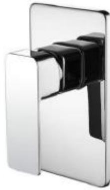
Sterlyn Bath Mixer & Square Spout 220 mm (Chrome)