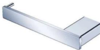
Single Towel Hook – Guest Toilet