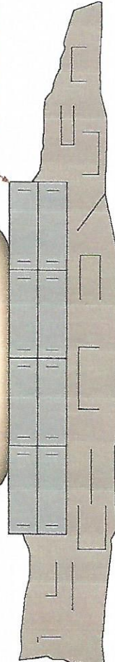
Typical water tank foundation.

:Homeowners must submit written proposals to the board of trustees for approval before tanks are installed.