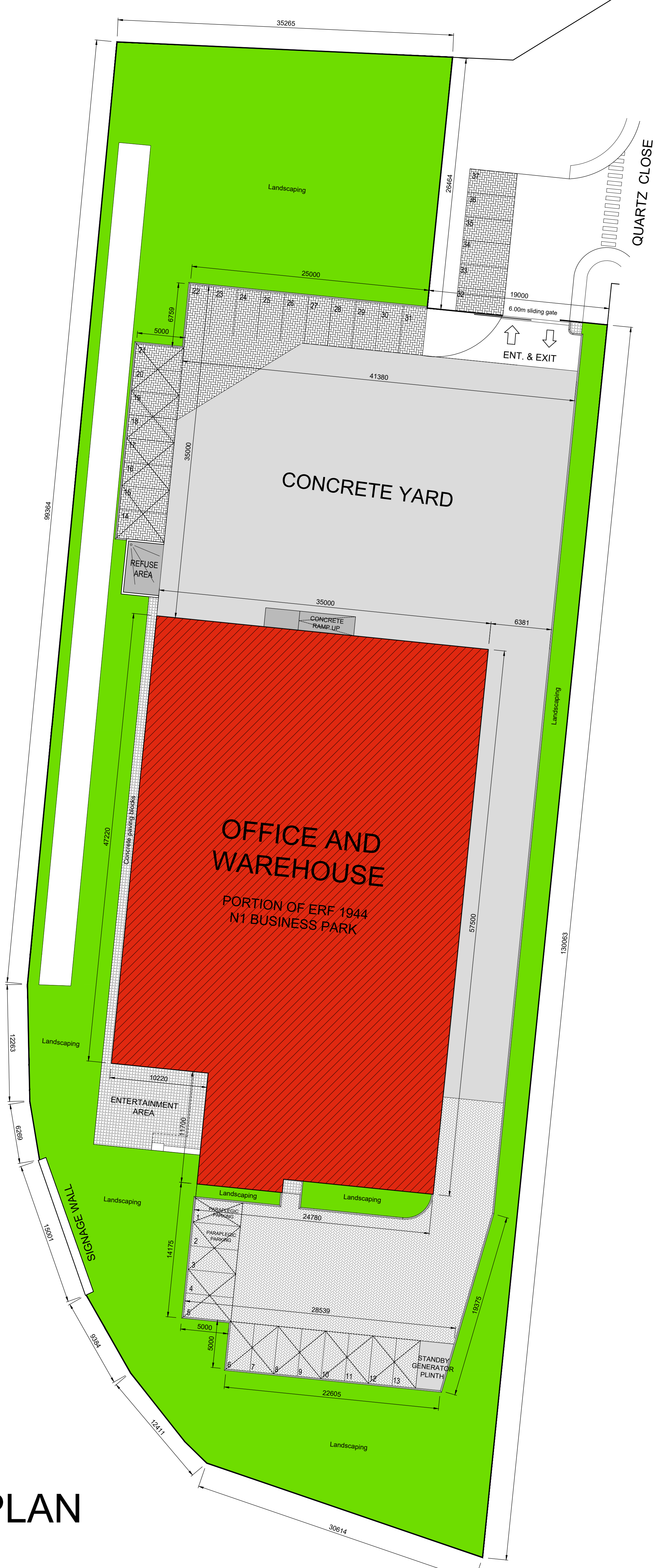
SITE PLAN SCALE 1:250